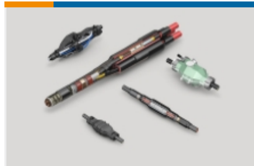
Joints &amp; Splices(1)